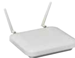
AP 7522E Indoor 802.11ac Up to 867 Mbps 2X2 MIMO