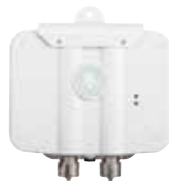
AP 6562E Outdoor 802.11n Up to 600 Mbps 2x2 MIMO