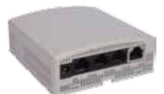
AP 7502E Wallplate 802.11ac Up to 867 Mbps 2X2 MIMO